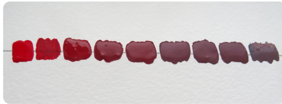
tones of red

A tone is a colour mixed with grey. Tones are less vibrant than the original colour. Using a tonal colour in a painting balances other intense colours and bright hues. When mixing a tone, begin with the pure colour and add grey paint a tiny bit at a time.