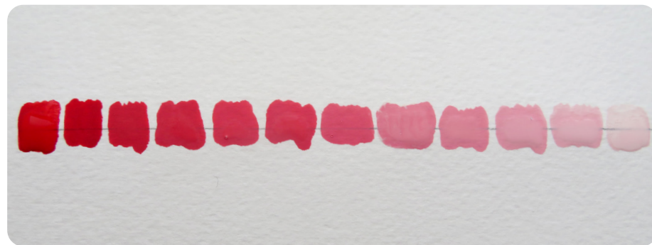
tints of red

A tint is a colour mixed with white. The more white paint that is added to the original colour, the lighter the tint. A tint can range from slightly lighter than the original colour, to almost white. When mixing a tint, begin with the pure colour and add white paint a tiny bit at a time.