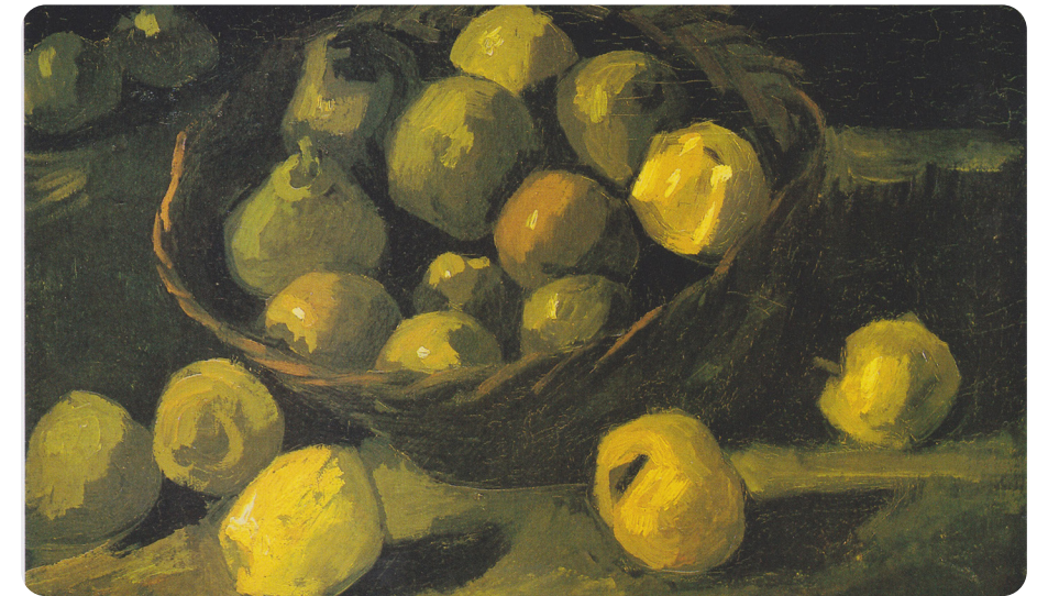
Still Life with Basket of Apples by Vincent van Gogh, 1885

Tints and shades are used in paintings to create light and shadow. This painting by Vincent van Gogh is a good example of the use of tints and shades. The apples in the foreground are painted in tints of green to emphasise light. The apples in the background are painted in shades of green to show that they are in the shadows.