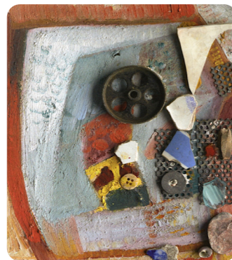
Merz Picture with Porcelain Fragments by Kurt Schwitters, 1945–1947

The German artist, Kurt Schwitters, lived from 1887–1948 and is famous for his mixed media collages called 'Merz pictures'. Artists who create mixed media collages use different joining methods, including gluing, stitching and tying.