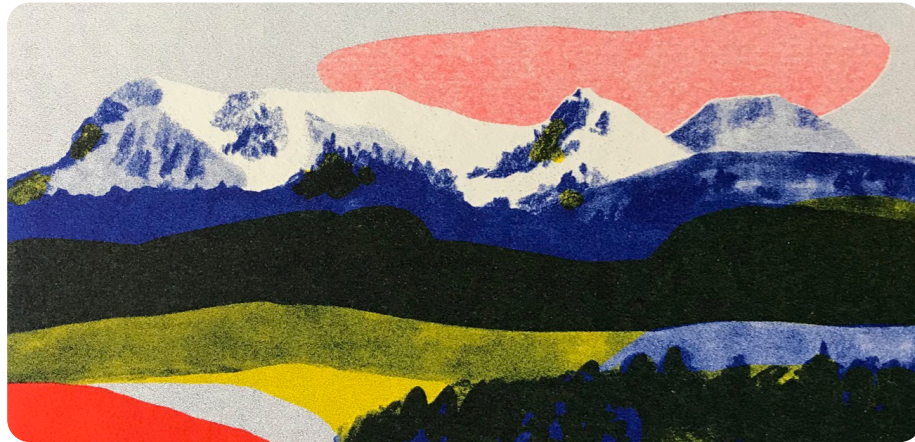
Mountains by Fanny Dreyer, 2019

Collage is art in which pieces of paper, photographs, fabric and other objects are arranged and stuck down onto a supporting surface or background. Collages can be abstract or pictorial.