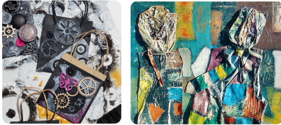
mixed media collages

The term 'mixed media' describes artwork that uses more than one medium, such as paper, fabric, photographs and 3-D objects, like buttons. Collage is a type of mixed media art.