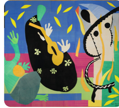
Sorrow of the King by Henri Matisse, 1952

Paper collages are made by gluing different types of paper to a background. The paper used to make a collage can be torn, folded, crumpled or layered to create interesting textural effects. Henri Matisse is well known for his collage art.