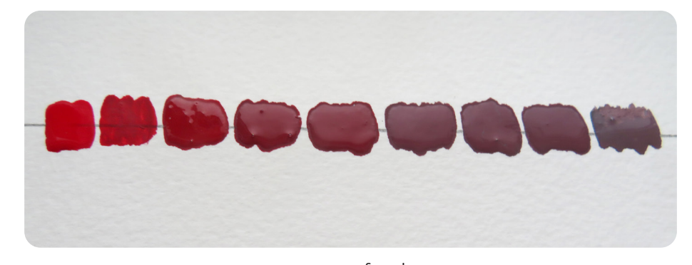
tones of red

A tone is a colour mixed with grey. Tones are less vibrant than the original colour. Using a tonal colour in a painting balances other intense colours and bright hues. When mixing a tone, begin with the pure colour and add grey paint a tiny bit at a time.