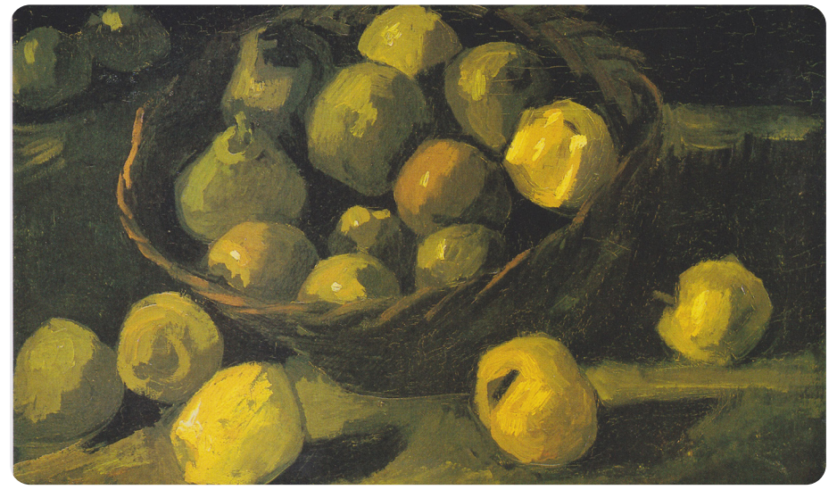
Still Life with Basket of Apples by Vincent van Gogh, 1885

Tints and shades are used in paintings to create light and shadow. This painting by Vincent van Gogh is a good example of the use of tints and shades. The apples in the foreground are painted in tints of green to emphasise light. The apples in the background are painted in shades of green to show that they are in the shadows.