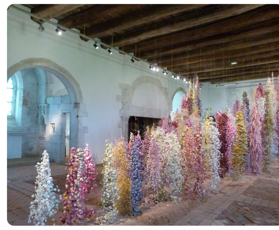
Banquet by Rebecca Louise Law, 2019

Some land artists bring materials inside from the outdoor environment to create installations in galleries and exhibition spaces.