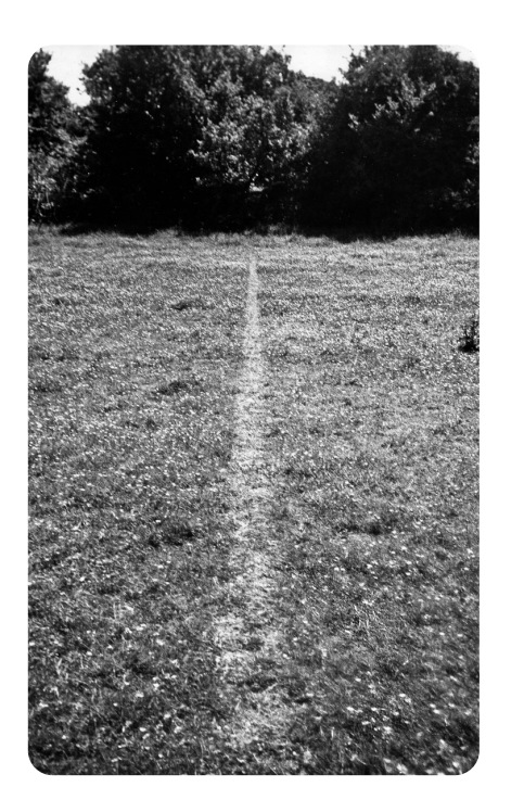
A Line Made by Walking by Richard Long, 1967

Land art can be made from many materials. Some artists sculpt the land into pieces called earthworks. Other artists use natural materials, such as twigs and rocks, to make sculptures within the landscape. Land art may be temporary, such as A Line Made by Walking. Richard Long made this line in the grass by repeatedly walking backwards and forwards.