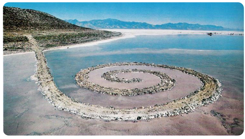
Spiral Jetty by Robert Smithson, 1970

Land art, or Earth art, is art that is made within the landscape. Land art is usually captured using photography because it is temporary and often made on a large scale.