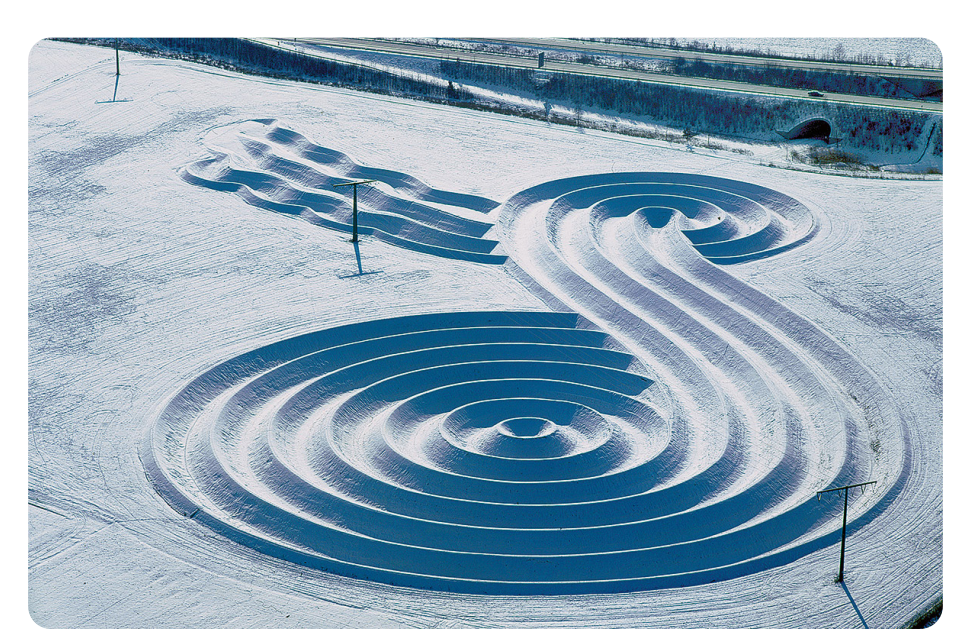
Earth Sign by Wilhelm Holderied, 1995

A relief sculpture projects from a flat surface. A high relief sculpture clearly projects out of the surface and looks like it is freestanding. A low relief, or bas-relief, sculpture does not project far out of the surface and is visibly attached to the background.